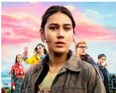
MY FATHERS' DAUGHTER