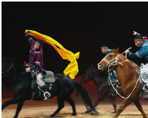
TO KILL A MONGOLIAN HORSE